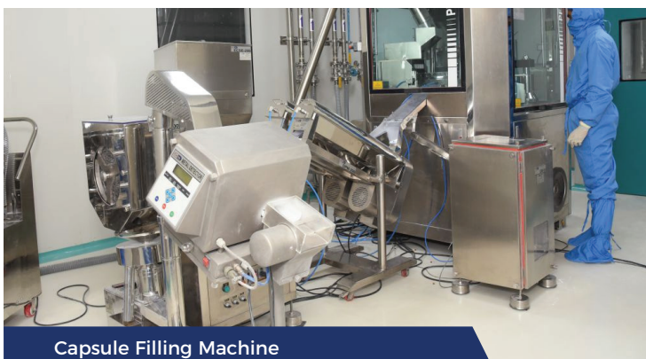
Capsule Filling Machine