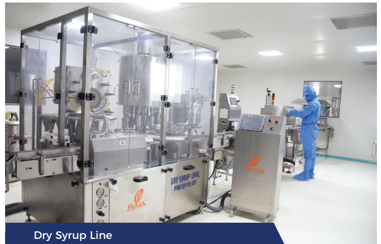
Dry Syrup Line