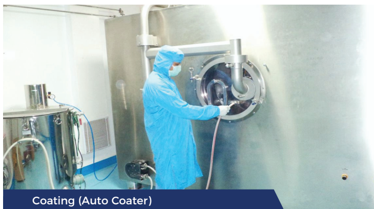
Coating (Auto Coater)