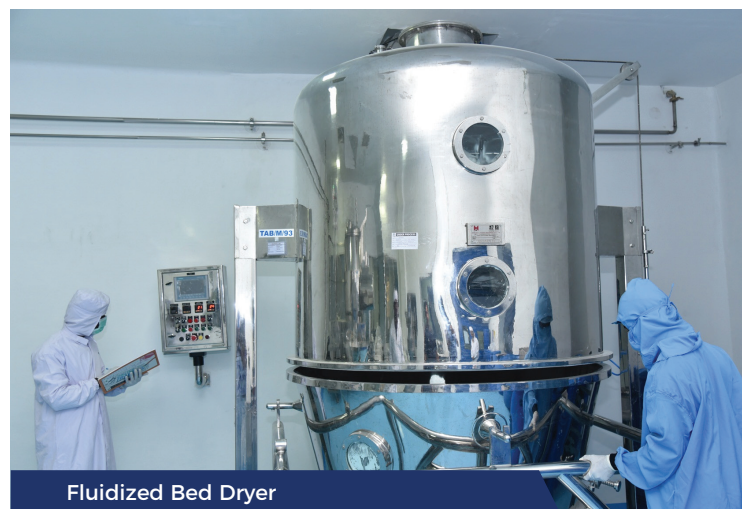
Fluidized Bed Dryer