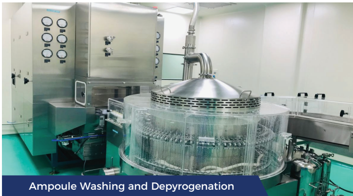
Ampoule Washing and Depyrogenation