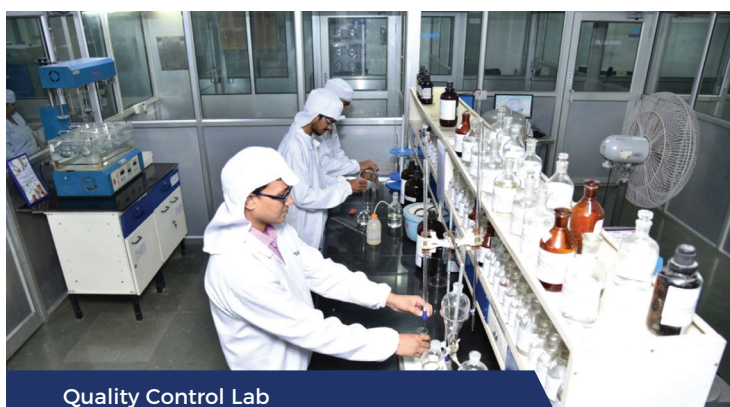
Quality Control Lab