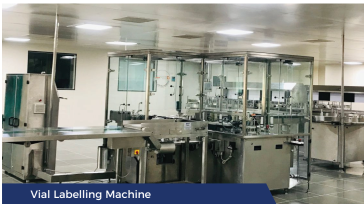
Vial Labelling Machine