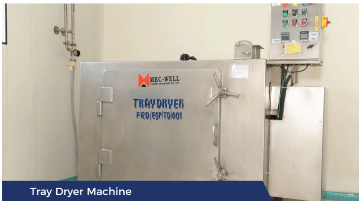
Tray Dryer Machine