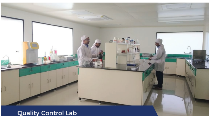
Quality Control Lab